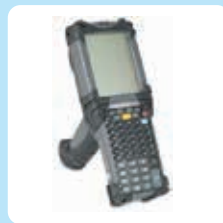
Data terminals & PDA