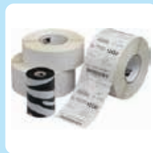
Consumables (labels, ribbons, PVC cards)